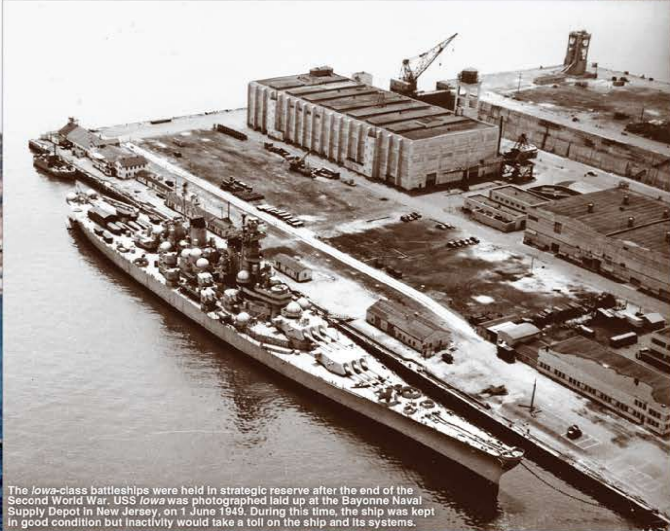
The Iowa-class battleships were held in strategic reserve after the end of the Second World War. USS Iowa was photographed laid up at the Bayonne Naval Supply Depot in New Jersey, on 1 June 1949. During this time, the ship was kept in good condition but inactivity would take a toll on the ship and its systems.

USS New Jersey steams toward a Japanese port during her second Korean War tour during May 1953. Note the harbor defense nets behind the battleship. President Truman was caught completely off guard by the communist invasion but he soon ordered ships, troops, and aircraft to the battle zone. The problem was that much of America's incredible WWII fighting force had been deactivated or scrapped. This called for ships to be pulled out of storage, modified, equipped, and sent to Korean Waters in a very short amount of time. New Jersey was recommissioned at Bayonne on 21 November 1950 and Capt. David Tyree welded his ship and crew into an efficient fighting force, sailing from Norfolk on 16 April 1951 and arriving off the east coast of Korea on 17 May of that year. Vice Admiral Harold Martin, commanding the United States 7th Fleet, placed his flag on New Jersey for the next six months.