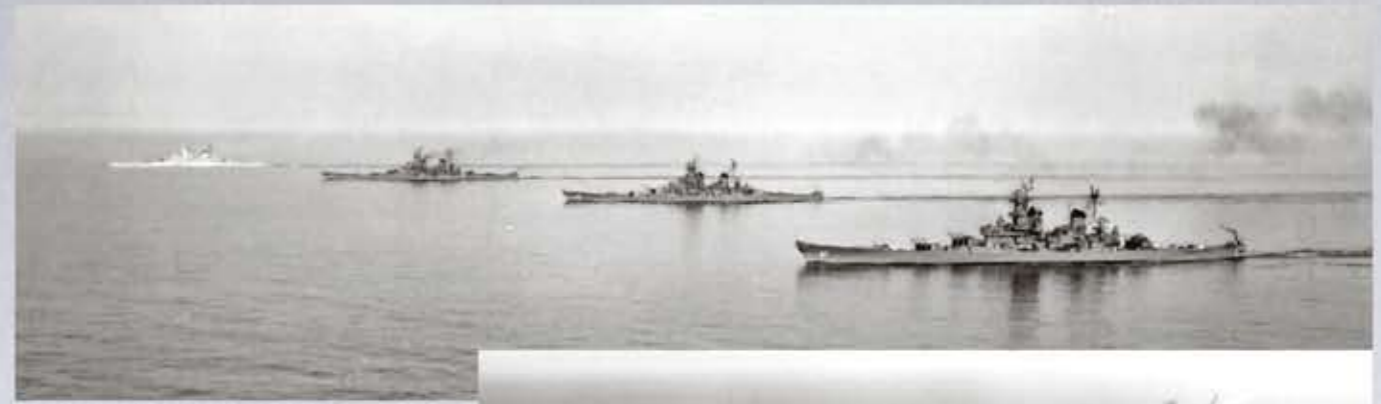
Battleship Division Two: In line abreast formation on 7 June 1954, this was the only occasion that all Iowa-class battleships were photographed together. The photo took place in the Virginia Capes and the closest is BB-61 followed by BB-64, BB-63, and BB-62. On 7 September 1956, New Jersey headed out for her first tour of duty with the 6th Fleet in the Mediterranean before returning to Norfolk on 7 January 1956.