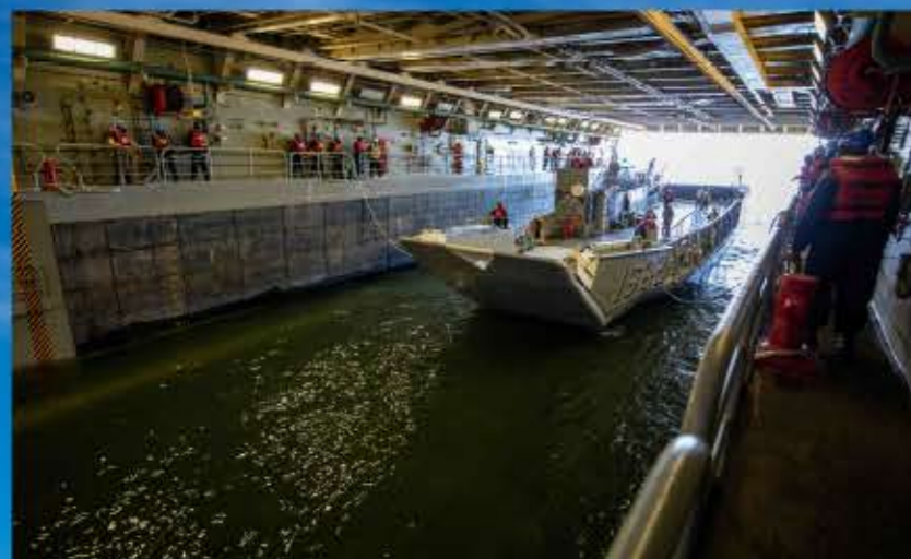
Sailors aboard the San Antonio -class amphibious transport dock ship USS Arlington (LPD-24) directs Landing Craft Utility LCU-1662 into the ship's well on 8 March 2021 in the Atlantic Ocean.