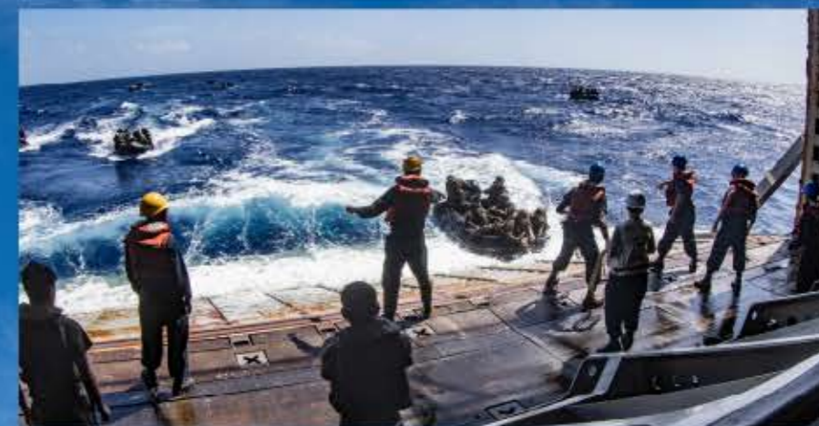
US Marines with Kilo Company, Battalion Landing Team 3/4, 31st Marine Expeditionary Unit (MEU), conduct well deck operations in preparation of a humanitarian assistance and disaster relief site survey aboard dock-landing ship USS Ashland (LSD-48), off the coast of Peleliu on 1 March. The 31st MEU is operating aboard ships of Amphibious Squadron 11 in the 7th Fleet area of operations.