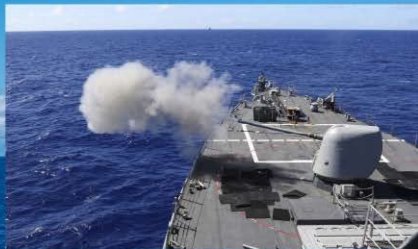
Arleigh Burke -class guided-missile destroyer USS Benfold (DDG-65) fires its MK45 5-inch gun for a live-fire exercise during the annual US-Japan Bilateral Advanced Warfighting Training Exercise. BAWT focuses on joint training and interoperability of coalition forces.