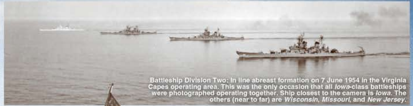
Battleship Division Two: In line abreast formation on 7 June 1954 in the Virginia Capes operating area. This was the only occasion that all Iowa-class battleships were photographed operating together. Ship closest to the camera is Iowa. The others (near to far) are Wisconsin, Missouri, and New Jersey.