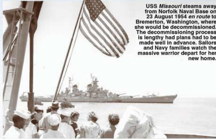
USS Missouri steams away from Norfolk Naval Base on 23 August 1954 en route to Bremerton, Washington, where she would be decommissioned. The decommissioning process is lengthy had plans had to be made well in advance. Sailors and Navy families watch the massive warrior depart for her new home.