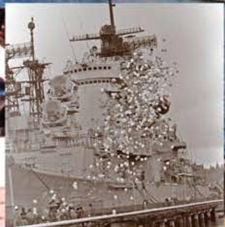
Hundreds of balloons are released from USS Missouri as the battleship begins her trip on 14 May 1984 to Long Beach Naval Shipyard in California from Bremerton, Washington, to undergo reactivation and modernization. Part of this involved installing Tomahawk missile launchers.