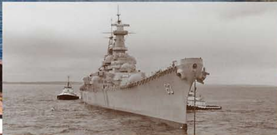
During May 1984, Missouri was readied for tow in the Strait of Juan de Fuca. Missouri was brought out from Bremerton by tractor tug and then Beaufort (ATS-2) picked up the tow to Long Beach.