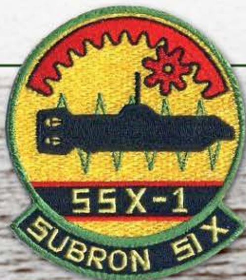
Jacket Insignia for the X-1.

During 1953, a few high-ranking officers in the US Navy began thinking about midget submarines. During WWII, such craft had enjoyed a certain amount of success when deployed on the side of the Axis. Great Britain, Germany, Italy, and Japan all fielded midget subs. The US Navy considered the type but decided not to build any but the British program for the midgets was carefully studied.