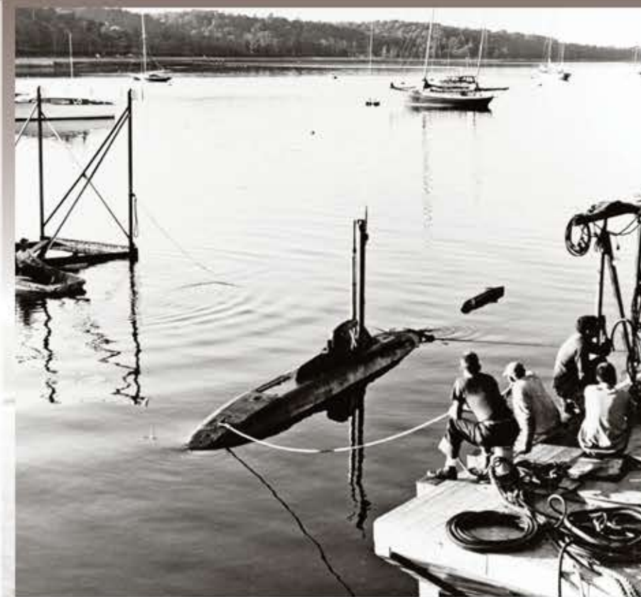
The X-1 in Long Island Sound during 1955. The vessel weighed in at 37 tons submerged, 32 tons surfaced.

By this point, it was obvious that coastal attack by air and/or submarine rendered the previous methods of defense as obsolete. In 1950, the