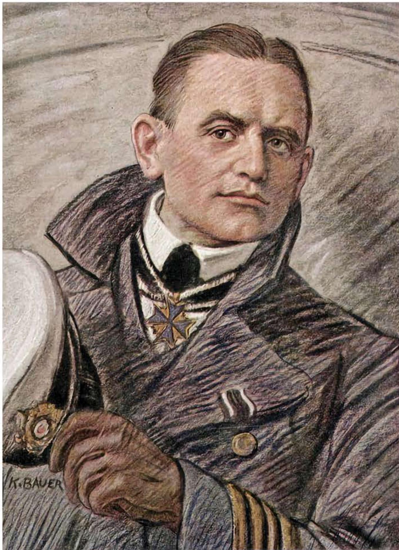
A drawing of Karl Neger wearing the Pour le Merite .