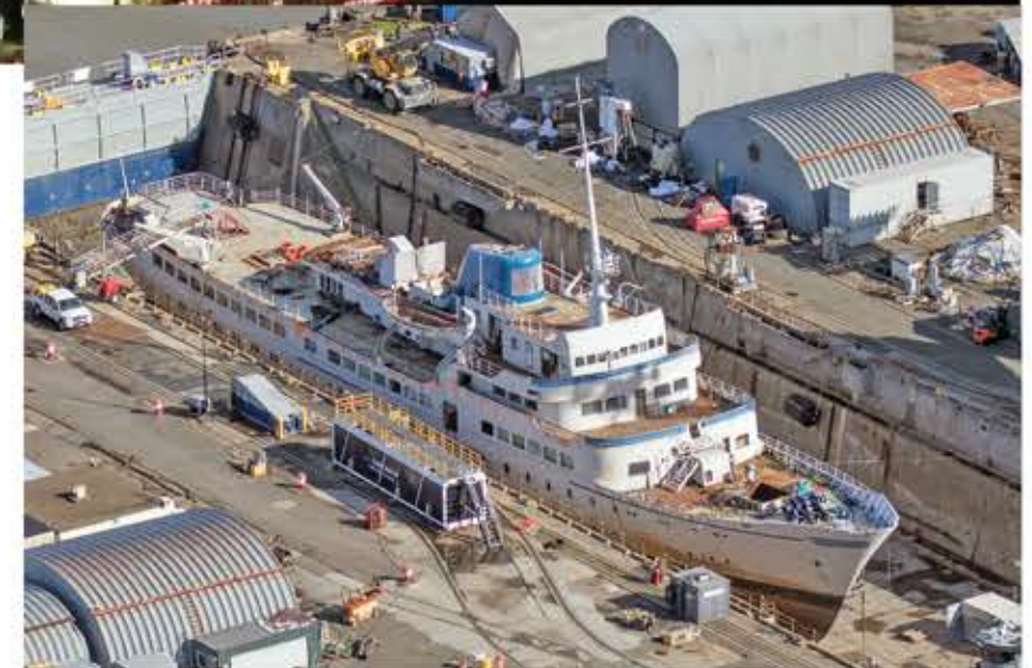
Aurora in what may be her last stop — a dry dock at Mare Island.

What is the future for Grand Romance ? It is probably bleak. It seems that this type of entertainment has gone out of style and it would cost a fortune to refloat and repair the sternwheeler. Unless local officials or the Coast Guard take some form of action, it appears Grand Romance will continue to go downhill and keep serving as refuge for the homeless and drug users. Vallejo city officials note