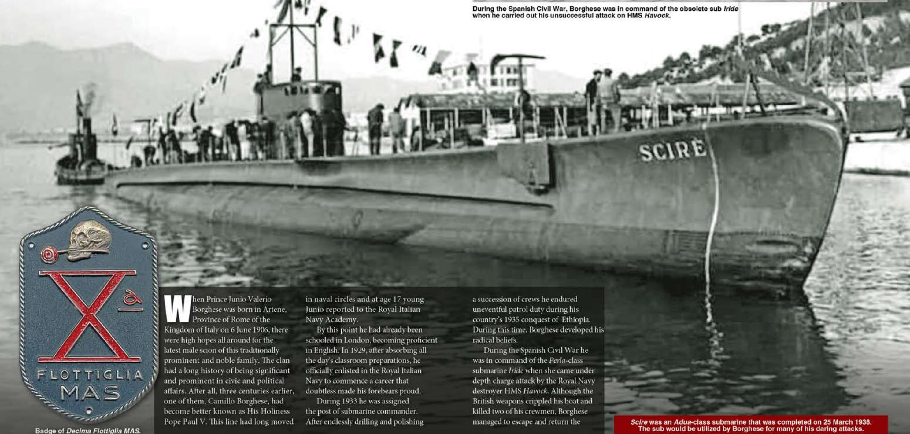
Scire was an Adua -class submarine that was completed on 25 March 1938. The sub would be utilized by Borghese for many of his daring attacks.