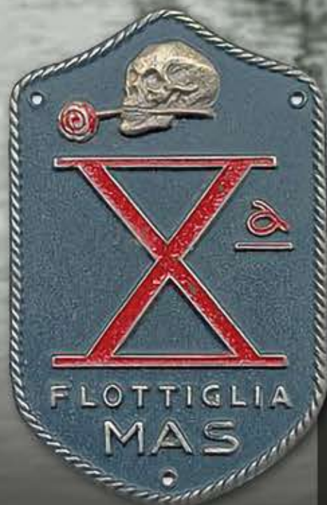
Badge of Decima Flottiglia MAS .

During the Spanish Civil War, Borghese was in command of the obsolete sub Iride when he carried out his unsuccessful attack on HMS Havock .