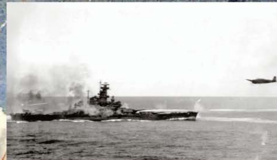
A Japanese Kate torpedo-bomber passing by South Dakota shortly after dropping its weapon. The torpedo attack on the battleship was not successful. Smoke on the ship is coming from anti-aircraft fire.